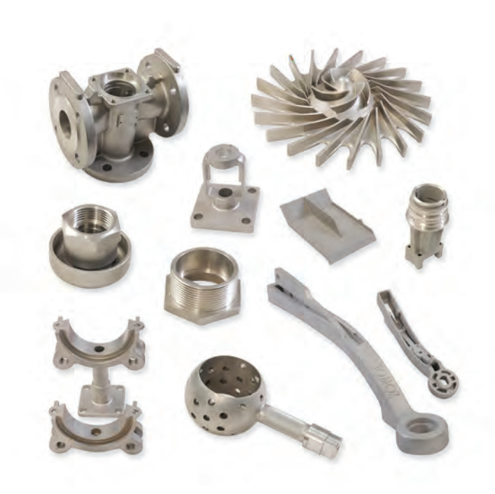
Wax Injection Pre Coat Shell Baking Assembly Coating Shell Baking Shell Baking Shell Baking Shell Baking Shell Baking

At Creative Castings Ltd., the policy to succeed is through continuous R&D, improvements in process control and adopting latest technology by time to time.